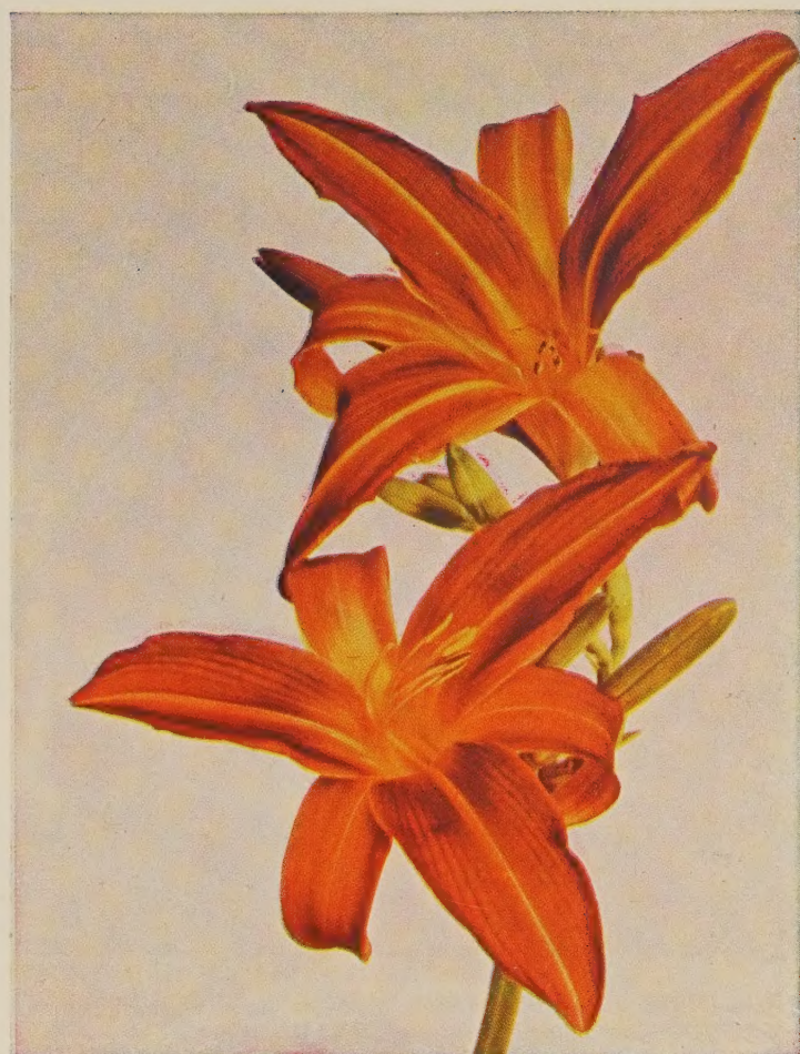
ONE OF THE NEWER DAYLILY SEED-LINGS